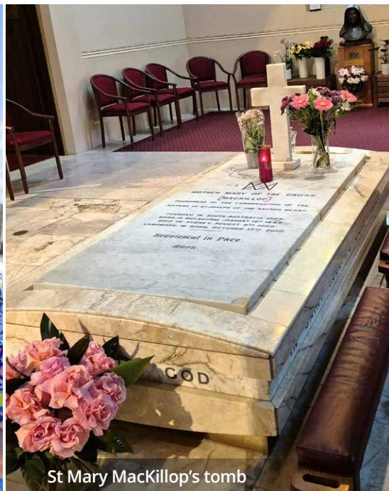
St Mary MacKillop's tomb

hosted by the parents of the local school. Penola overnight (BD)