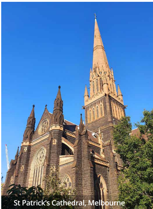
St Patrick's Cathedral, Melbourne